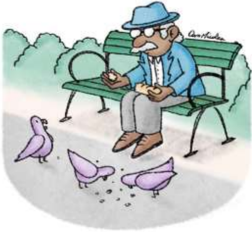
"Got anything else? I gave up carbs."